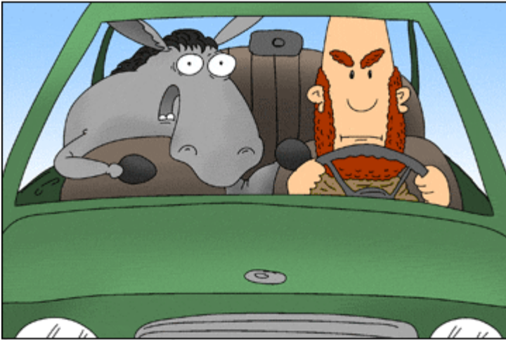
(See Numbers 22:22-34)