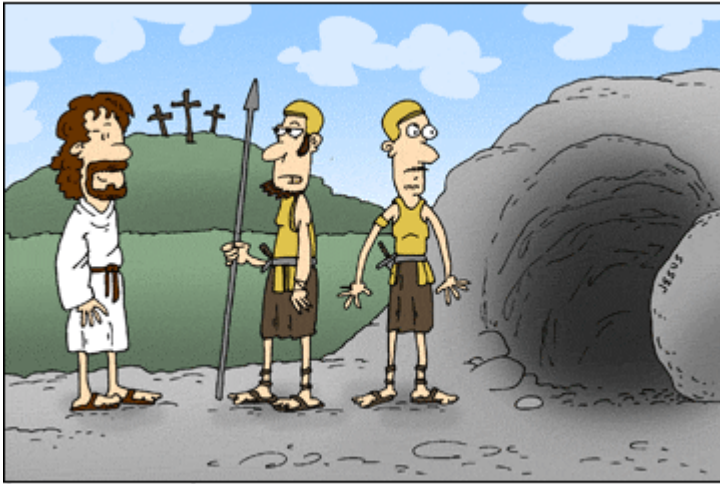
(See John 20:1-18)