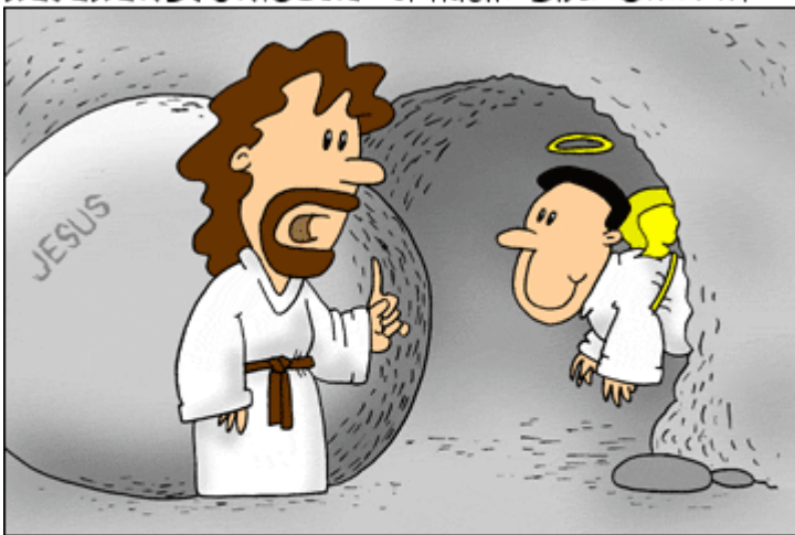
(See John 20:1-18)